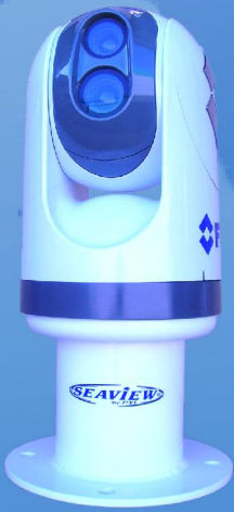
PM-5FN-8 + SV-FMADAPT-2 (5" mount for Flir M-Series) note: base fits AMA-W wedge