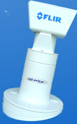
AMA-W (Adjustable wedge 0° to 12° fits the base of PM-5FN-8)