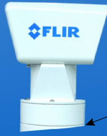
(Flir Navigator shown with FW-4-1)