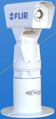
PM-5FN-8 (5" mount for Flir Navigator) note: base fits AMA-W wedge