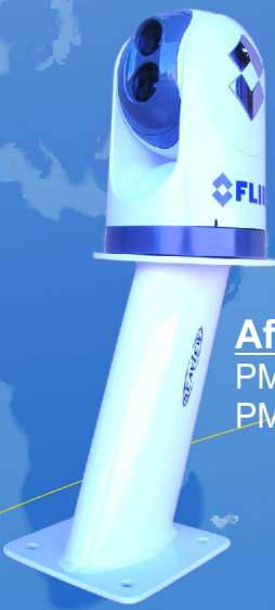
Aft Leaning Mounts PMA-5-7A + SV-FMADAPT-1 (5" AFT) PMA-12-7A + SV-FMADAPT-1 (12" AFT)