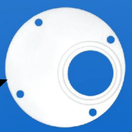
FW-4-1 (4° Wedge for Flir Navigator)